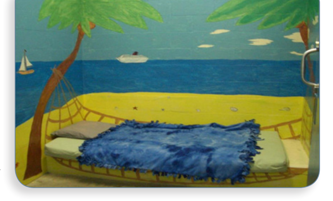
Marion Regional Juvenile Detention Center

Justice systems are also beginning to recognize that most people they serve have experienced severe trauma. In response, some adult and juvenile correctional facilities are implementing trauma interventions such as TAMAR and TARGET<sup>6</sup>. Others are modifying practices and environments to be more trauma-informed. For example, with NCTIC's assistance, the North Carolina Department of Juvenile Justice has re-written job descriptions, eliminated the requirement for security-type uniforms, and provided "comfort bags" of sensory items to all youth. They have also eliminated the use of seclusion by coaching staff to pay more — rather than less — attention to youth whose behavior is starting to deteriorate.